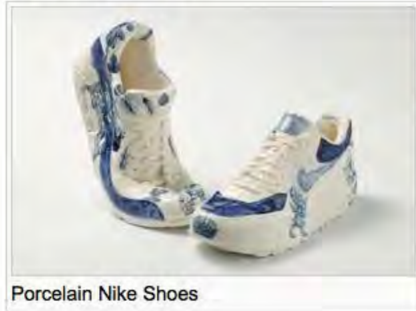
Porcelain Nike Shoes